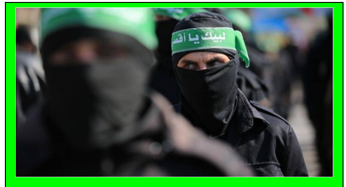
Hamas terrorists are sworn to the complete destruction of Israel.

While the conflict between Israel and Hamas was in progress, the world witnessed a major increase in anti-Semitism. In Europe, thousands of protestors gathered to show their support for Hamas. At the same time, they were very vocal in their hatred for Israel and the Jews. In Germany, some were calling for people to kill Jews and rape Jewish women.