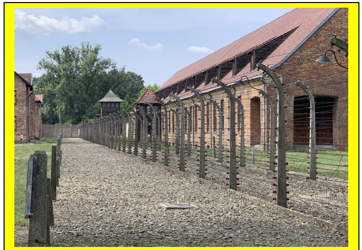
Electric fences and guard towers at Auschwitz where Jewish prisoners were kept awaiting their death in the Nazi death camps.

Israel’s beginning in Egypt as a nation in the days of Moses, anti-Semitism has reared its ugly head. Since that time, anti-Semitism has become an epidemic in all the Gentile nations. According to the prophetic Word, it will reach its final climax during the reign of the Antichrist during the Tribulation Period. Daniel 12:1 states that the last days will “be a time of trouble, such as never was since there was a nation, even to that same time.”