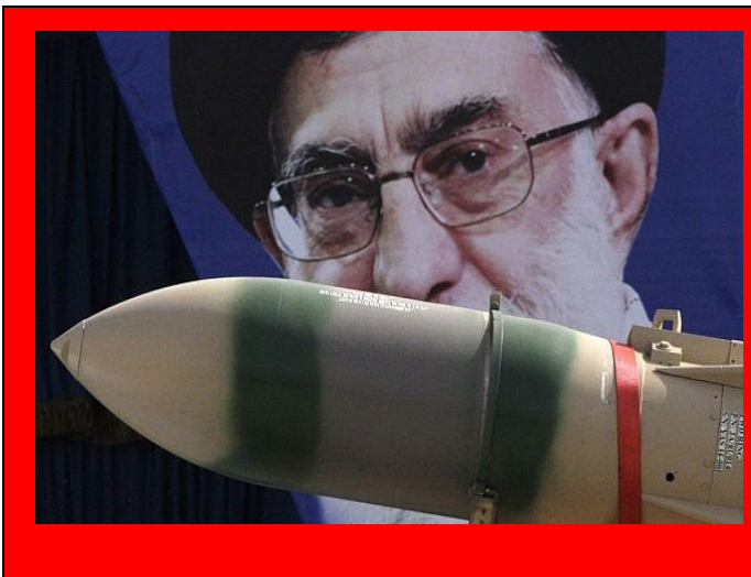
The radical Islamic leadership of Iran is committed to the destruction of the state of Israel

Israel has continued to make it known that its war is not with the Palestinian people, but with their corrupt, militant, terrorist leadership. These leaders hide behind Islamic doctrines that call for the destruction of all infidels – in this case, Israel. Hamas has made it clear they will never accept the presence of Israel. They will continue to wage war until the last Jew is forced out of the land. They want the entire land of Israel, not just a portion of it.